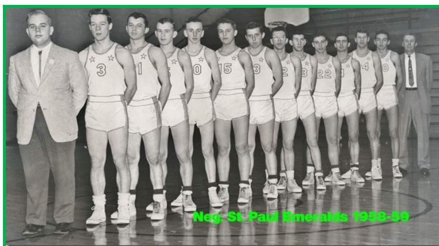
Neg. St. Paul Emeralds 1958-59